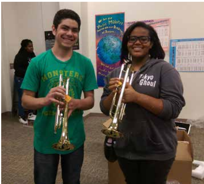
YES! New trumpets for Greene County MS, Snowhill NC.