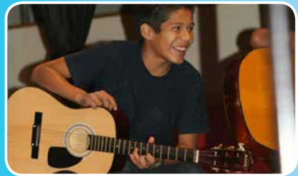
Happiness at Columbus Middle School, Canoga Park CA.

“I LOVED watching them crack open the brand new instruments and realize they don't have to wash them each time they play!”