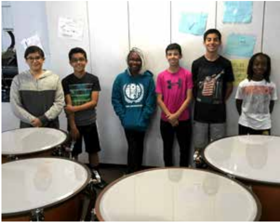
A happy percussion section at Columbia Middle School, Sunnyvale CA.

This is what it's all about – because of you, kids find their voice and their joy. Thank you!