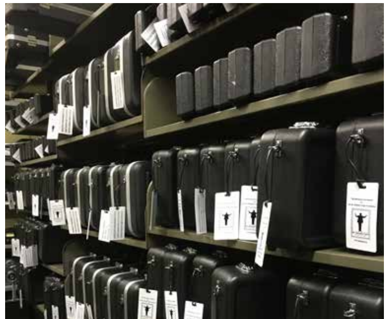
Rowland Elementary in West Covina CA is stocked up and ready for eager players.