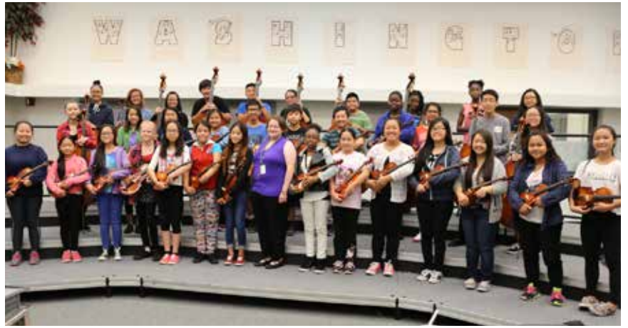
Strings all around at Washington Technology Magnet School, St. Paul MN.

“I LOVED watching them crack open the brand new instruments and realize they don't have to wash them each time they play!”